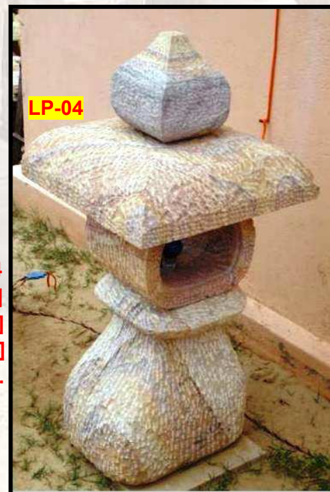
Light Lamp - LP-04 Lenth - 14" [355mm] Width - 14" [355mm] Height- 36" [915mm] Weight – 60 Kg.