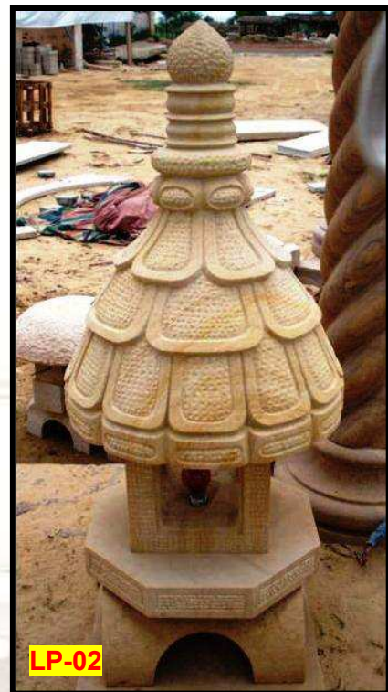
Light Lamp - LP-02 Lenth - 14" [355mm] Width - 14" [355mm] Height- 33" [840mm] Weight – 125 Kg.