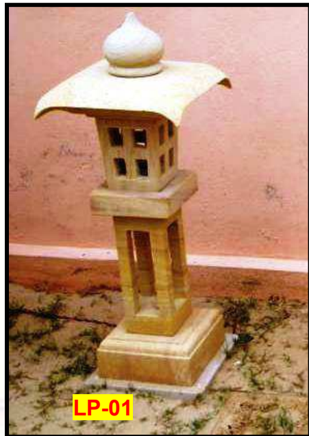
Lamp Post - LP-01 Lenth - 14" [355mm] Width - 14" [355mm] Height- 30" [760mm] Weight – 70 Kg.